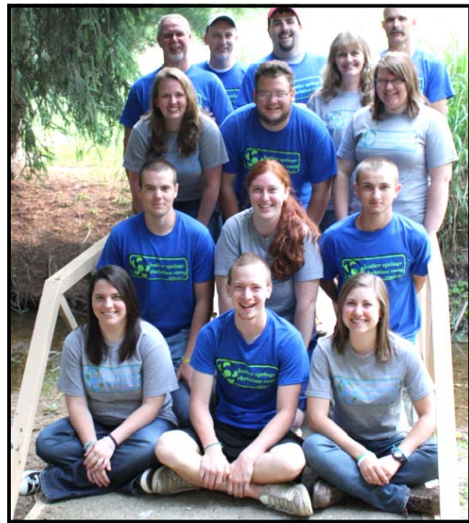
2011 BSCC Summer Staff —Philippians 2:1-11

I lose it every time. Parents and grandparents come up to me after the baptism with tears in their eyes and a frog in their throats and commend me on the work that I do at camp and how I have had an impact on their child/grandchild getting baptized. It would be nice to take all the credit but that would be foolish of me. This ministry here at Butler Springs is not a “one man show”, it's a collaboration of those 513 volunteers, 14 summer staff, 4 full time staff, and 54 T-N-T volunteers that has made the difference in that kid's life. We keep the grounds looking nice, constantly clean the dorms, make sure everyone has a great tasting hot meal three times a day, and repeatedly provide for the needs and requests of the deans—basically keep the camp running distraction free so the 1,730 kids can focus on Christ and not get distracted by the little things. That's teamwork. That's camp. That's why we do what we do. That's ministry. That's Butler Springs!!!