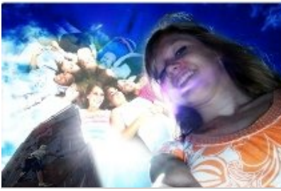
Camp Newsletter 2011 Summer Edition